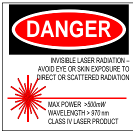
THIS PRODUCT COMPLIES WITH 21CFR 1040.10