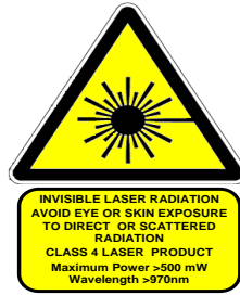
REFERENCE IEC 60825-1 Edition 2.0