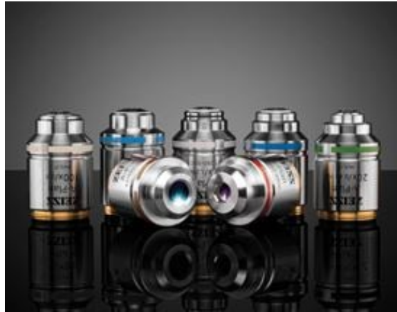
ZEISS A-Plan Objectives

ZEISS A-Plan Plan Achromat Infinity Corrected Objectives are designed for a variety of routine life science applications. These objectives exhibit excellent color correction and flatness of field that satisfy ISO 19012-1:2013 standards. They are ideal for brightfield inspection of fixed and stained tissues or cells in fluorescence applications. The large field number of 23mm facilitates fast screening of samples. ZEISS A-Plan Plan Achromat Infinity Corrected Objectives are corrected for standard cover slips with 0.17mm thickness.